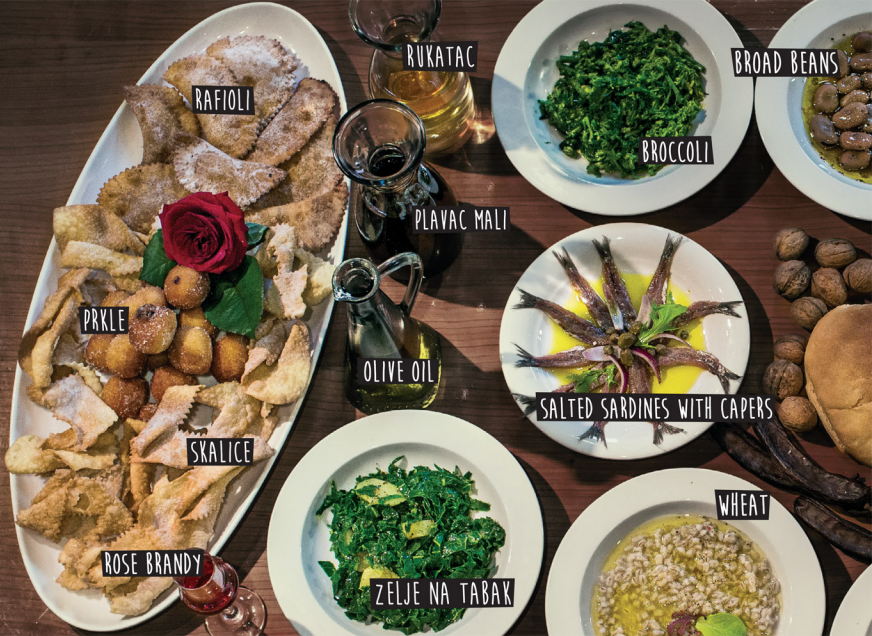
ZELJE NA TABAK